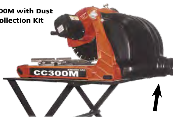
CC300M with Dust Collection Kit

Connects to most shop vacuums, our pro collection vac and dustless systems