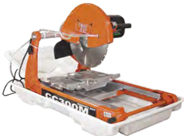
CC300M with Wet Cut Kit