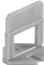
LS250CLIP316 LS500CLIP316 LS2000CLIP316

1/32" joint size clip for 1/8" to 1/2" tile thickness.