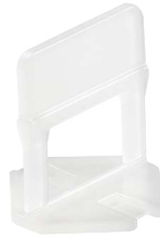
LS250CLIP LS500CLIP LS2000CLIP

1/16" joint size clip for 1/2" to 3/4" tile thickness.