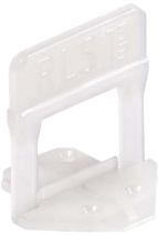
LS250CLIP132 LS500CLIP132 LS3000CLIP132

1/8" joint size clip for 1/8" to 1/2" tile thickness.