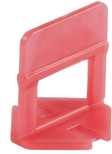
LS250CLIP18 LS500CLIP18 LS2000CLIP18

1/16" joint size clip for 1/8" to 1/2" tile thickness.