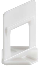
LS200CLIPL LS400CLIPL LS1500CLIPL

1/16" joint size clip for 1/2" to 3/4" tile thickness.