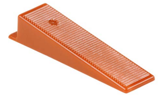
LS250WEDGE LS500WEDGE LS1000WEDGE

3/16" joint size clip for 1/8" to 1/2" tile thickness.