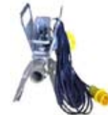
Optional Grout injection kit