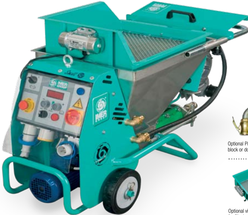
Shown with optional vibrating screen and compressor

The Mighty Small 50 has proven itself on challenging jobsites across America. Whether it is pumping grout into forms on a bridge deck repair project, spraying fireproofing on a high rise, or filling blocks with grout ...our pumps have a resume of success on all kinds of jobsites, with all kinds of contractors. Call us when you need help with a tough pumping application...we can help! (800) 275-5463. Watch the Small 50 video at www.IMERusa.com