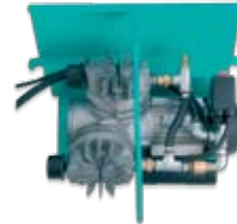
Optional continuous duty dual diaphragm air compressor.