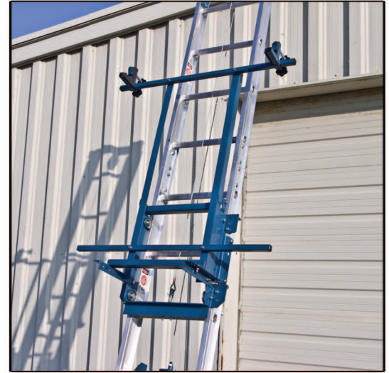
Solar Panel Attachment