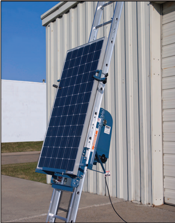
Solar Panel Classic Electric Platform Hoist

Platform Hoists are easy to transport and assemble, and require minimum maintenance. A variety of accessories makes RGC Platform Hoists the most versatile on the market.